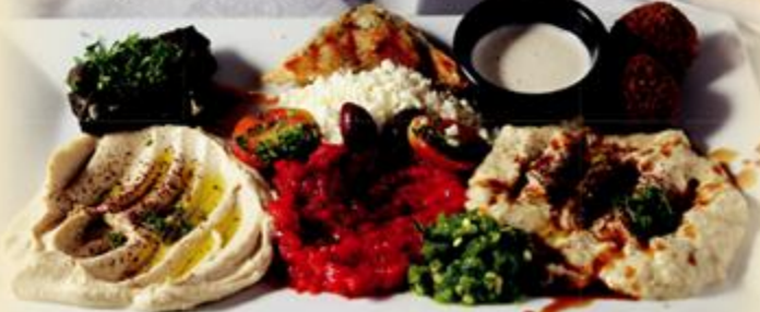
JASMINE VEGETARIAN COMBINATION