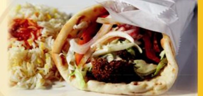
FALAFEL HUMMUS SANDWICH